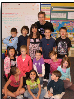
Happy holidays from Room 11!

We just recently finished our I.B. planner on How the World Works , a study of how Earth's geographical features are in a constant state of change. Our class was enthusiastic and principled in the science lab, which really helped to maintain our engagement in the inquiry process. Several students even found experiments that they could do as a class or independently.